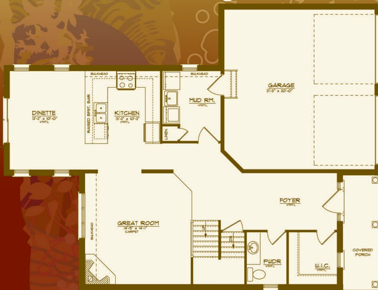
Main Floor 977 Sq. Ft.